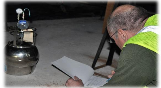
Sampling Ambient Air Beneath the Manufactured Home

In February 2015, the DERR utilized the Hazardous Substance Mitigation Act (HSMA) fund to evaluate the indoor air space of an occupied manufactured-home, and the sub-slab airspace beneath the basement of another. The analyses of indoor air in the manufactured home showed no petroleum impacts, but the monitoring of sub-slab air of the second home, from March 2015 through July 2016, showed the presence of chemicals of concern, but they were below action levels. The DERR concluded that there was a low risk for vapor intrusion into both homes.