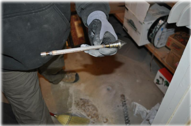
Installing Sub-slab Vapor Monitoring Point