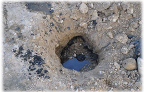
Petroleum Contamination Evident in Subgrade Soils and Groundwater at Impacted Home