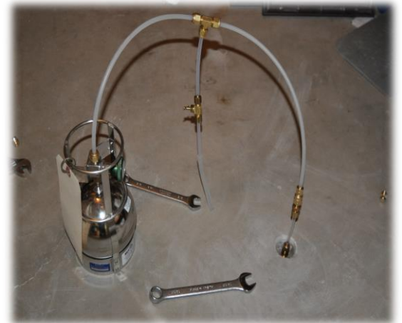
Sampling Sub-slab Vapor Monitoring Point

By January 2017, the DERR, DWQ and AGO decided that the DERR would cease using the HSMA fund and working on the case, and that DWQ would move forward with enforcement actions to get the responsible party (RP) to fully investigate its petroleum release. To date, the impacted home under construction was never finished, the petroleum plume continues to exist, and the DWQ, AGO and RP continue work to resolve this matter.