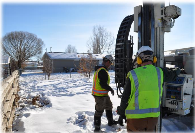
Sampling Near Head of Plume

By January 2017, the DERR, DWQ and AGO decided that the DERR would cease using the HSMA fund and working on the case, and that DWQ would move forward with enforcement actions to get the responsible party (RP) to fully investigate its petroleum release. To date, the impacted home under construction was never finished, the petroleum plume continues to exist, and the DWQ, AGO and RP continue work to resolve this matter.