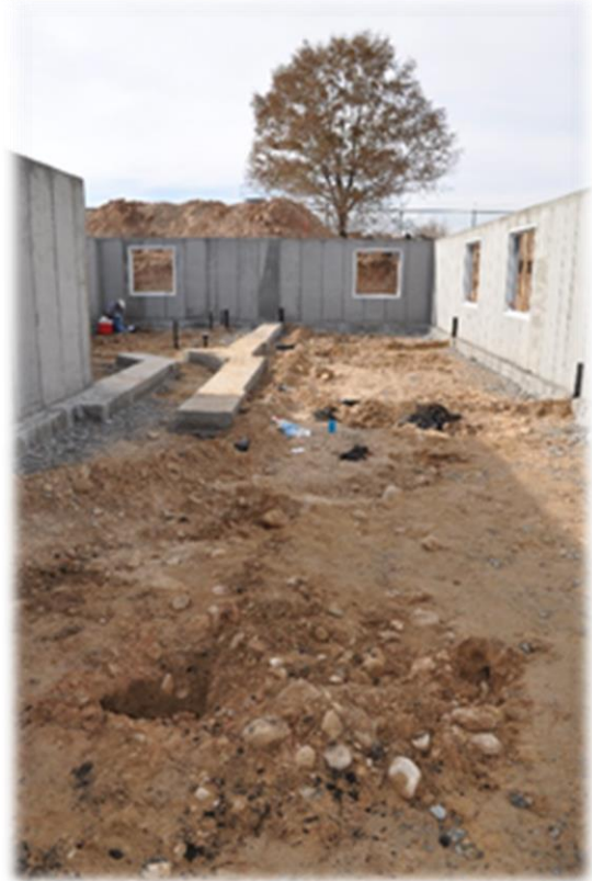
Impacted Home November 2013 and Sampling Holes

The Naples Truck Stop release, 1993, had an AST piping problem with up to 8,000 gallons of gasoline lost. The release was managed by the Region 8 Environmental Protection Agency (EPA), with the EPA investigating, then treating