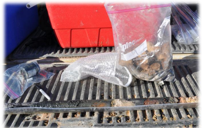
Soil Core Near Presumed Source Area