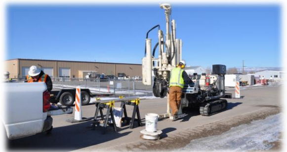
Direct-push sampling operations during the DERR 2014 Investigation

One year later, following Pilot's inaction to evaluate off-site impacts from their property, the DERR determines that additional studies of occupied homes at the head of the plume were warranted. In coordination with the DWQ and the AGO, the DERR setup work that would evaluate the potential for petroleum vapor intrusion into several homes.