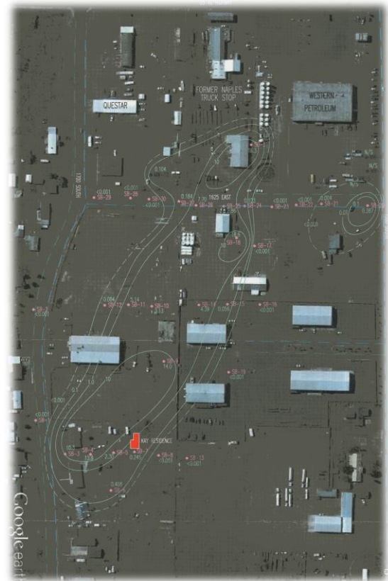
Dissolved phase benzene map, in ug/L, from the DERR 2014 Investigation

In March 2014, the DERR determined that the Naples plume source was likely the Western Petroleum facility, and worked with the DWQ and the Utah Attorney General's Office (AGO), for transfer of the case file to the DWQ, due to the AST regulations of the time. The DWQ then issued a Notice of Violation to Western Petroleum, for unauthorized discharges to groundwater. In August 2014, Pilot Corporation (Pilot), who acquired the Western Petroleum facility, conducted an on-site study of a gasoline line leak that the former owners discovered and repaired in February 2013. Pilot's report indicated that the 2013 line-leak was not the source of offsite contamination investigated by the DERR.